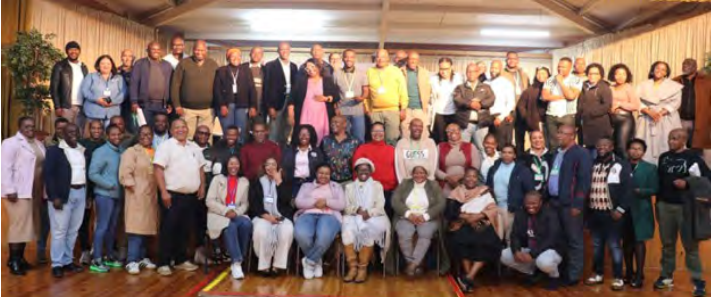
Delegates from the municipal ICT summit

The Department of Cooperative Governance and Traditional Affairs (COGTA) successfully hosted a two-day Municipal Information Communication Technology (ICT) Summit in Jeffreys Bay from 07–08 May 2026, bringing together municipal leaders, ICT professionals, government officials, and stakeholders from across the Eastern Cape and beyond to advance the digital transformation agenda within local government.