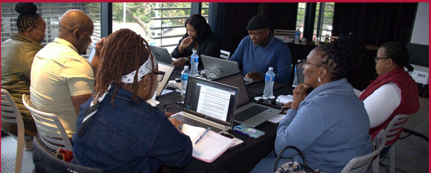
Municipal Performance and Assessment team

She added that the ultimate objective of the process remained firmly centered on improving the lives of citizens, "Our responsibility goes beyond assessment, it is about ensuring that municipalities are empowered to deliver responsive, efficient, and sustainable services. Upon completion, the Section 47 Consolidated Report will be submitted to the Provincial Legislature, the Minister, and the National Council of Provinces, reinforcing its importance as a key instrument of accountability and cooperative governance. The insights generated through this process will guide interventions that are aimed at improving governance and accelerating service delivery across the province," she concluded.