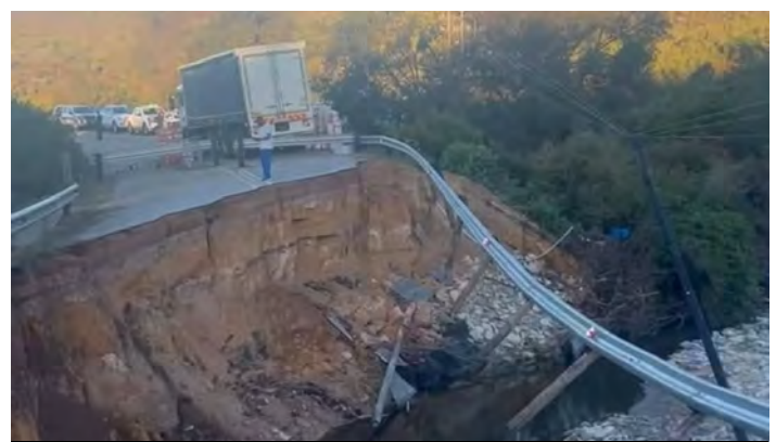
Damaged bridge in Rocklands