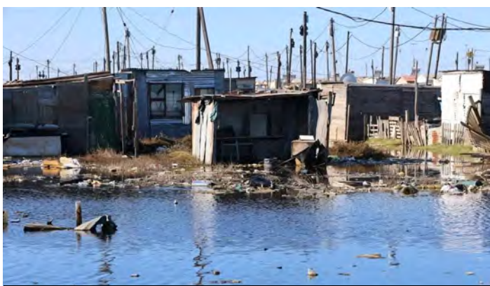
Nomakanjani Informal Settlement

“Through collaborative action and responsive leadership, we are working to restore normality and safeguard the wellbeing of the residents. As recovery efforts continue, we remain focused to restore dignity, rebuild livelihoods, and ensure support to the affected communities,” said the MEC.