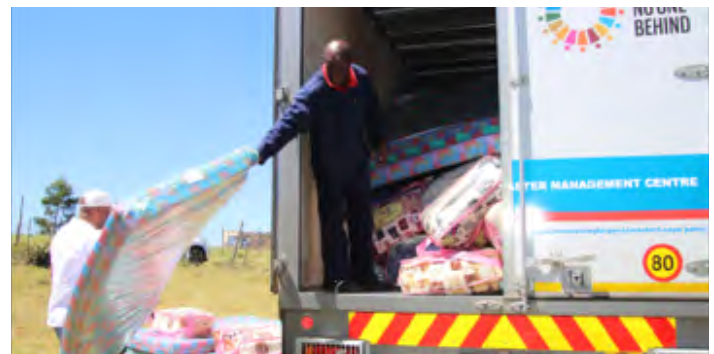
Officials loading disaster relief materials

The branding serves not only as a representation of government's commitment to responsive disaster management services, but also enhances visibility, accountability, and public confidence during disaster relief operations throughout the Eastern Cape