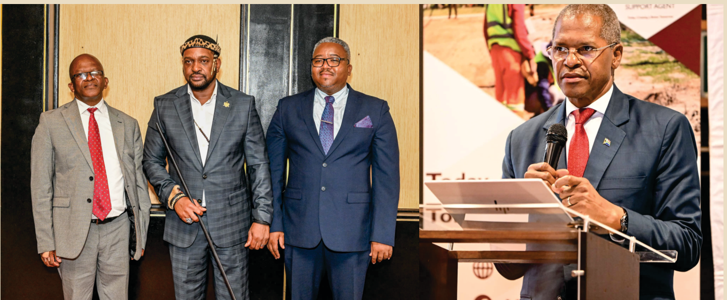
L-R: King Daluxolo Sigcau, King Misuzulu Zwelithini, King Ndlovuyezwe Ndamase and Minister Hlabisa

“We must prioritise water, roads, health and housing through proper planning and expert support. Communities are eager to see the project commence rather than endless meetings,” said King Ndamase.