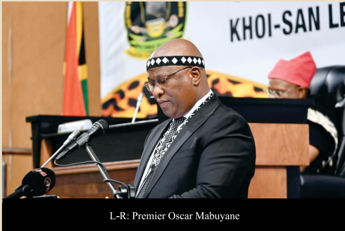
L-R: Premier Oscar Mabuyane