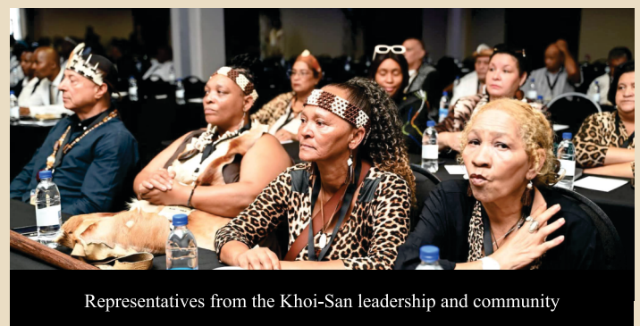
Representatives from the Khoi-San leadership and community

In addition, MEC encouraged traditional leaders to take advantage of departmental bursary schemes and other opportunities for further education and leadership development.