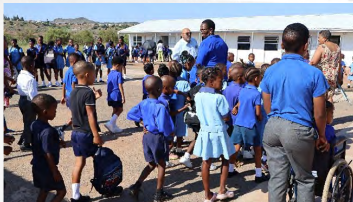
Learners of Alhiet Van Der Merwe Primary School