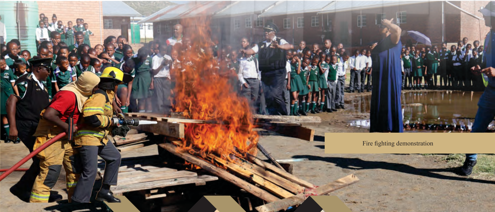
Fire fighting demonstration

Councillor Mposelwa added that the non-negotiables initiative underscores government's commitment to enforce accountability, improve compliance, and ensure that municipalities are capacitated to deliver sustainable and reliable services to communities.