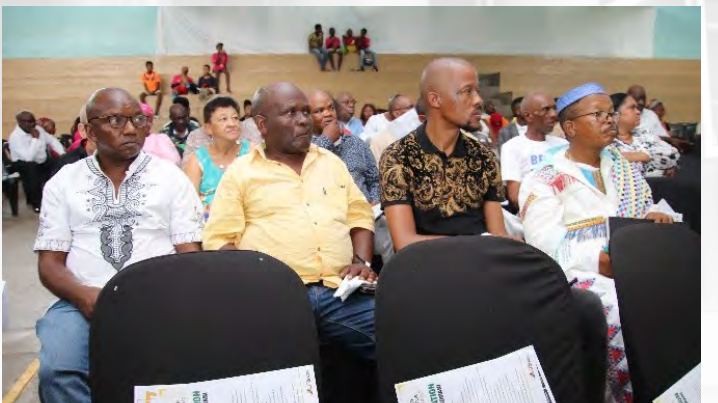
Community of Komani at the Reconciliation Day Event