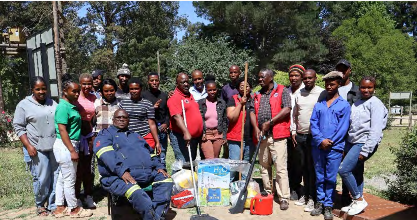
Officials from Provincial Disaster Management Centre, Raymond Mhlaba Local Municipality and the trained volunteers