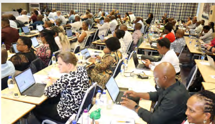
Attendees of the EC Municipal Capital Review Session

The review session concluded with a shared commitment among all stakeholders to strengthen planning, reporting, and accountability mechanisms that will ensure the RAS drives measurable improvements in infrastructure performance across the province.