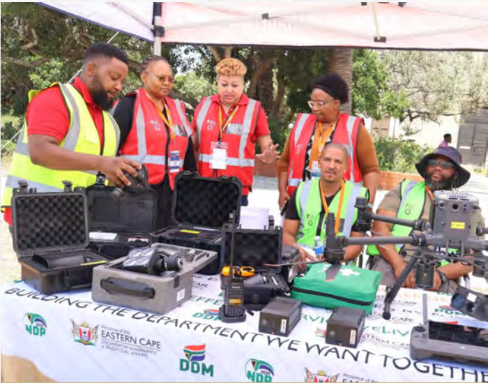
Eastern Cape Provincial Disaster Management Team

Deputy Minister Prince Zolile Burns-Ncamashe expressed heartfelt appreciation for the dedication shown by all teams, noting that the exercise demonstrated a collective commitment to building safer, more resilient communities. "I commend the national and international participants for their professionalism, cooperation, and willingness to share expertise."