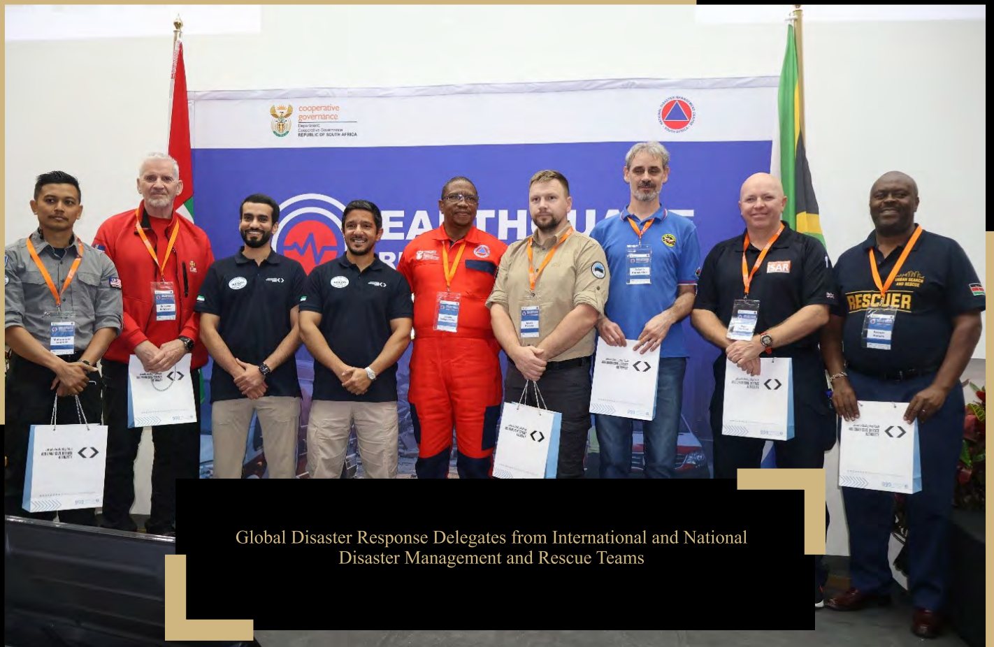
Global Disaster Response Delegates from International and National Disaster Management and Rescue Teams